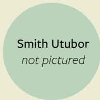
Smith Utubor not pictured